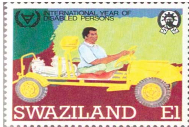
Country Swaziland; Date 1981; Disability Amputee; Number SG392 Theme Access|| World Health Organisation WHO