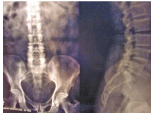
Fig 2- X-ray Spine