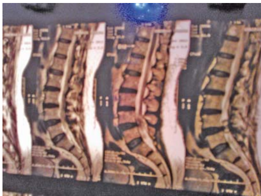
Fig 3- MRI Scan