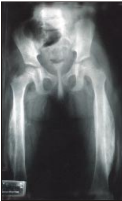
Fig. 4 X-ray Shows Significant maturation of HO and osteoporosis of both femur 14 months

phosphatase 171U/L after 14 months (chart 2). Thigh swelling decreased significantly and range of motion at both knees completely recovered. X-ray revealed significant maturation of HO at middle third of both thigh and osteoporosis of femur after 14 month (fig3 and 4).