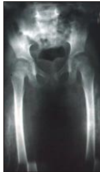
Fig.2 X-ray Shows HO of Middle one third of both thighs

the knee joints (fig1 and 2). Knee flexion was possible to only 15 degree from neutral position both side. Investigations revealed an ESR of 80 mm during 1st hour and alkaline phosphatase of 601U/L (n = 130 IU ). X-ray showed early HO in the middle one third of anterior aspect of both thighs. She was given indomethacin 25 mg thrice daily, gentle range of motion exercises and proper positioning of extremities. She remained in vegetative stage for two months and cognitive function did not improve. Follow up investigations showed decrease in ESR to 3mm during 1 st hour (Chart 1 ) and alkaline phosphatase of 461U/L at 4 months and a further decrease in alkaline