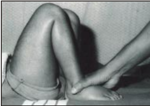
Fig.3 Marked retution of thigh Swelling and full flexion of both knee 14 months after follow-up